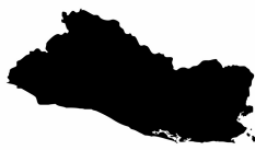
2. El Salvador