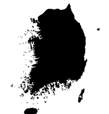
8. South Korea